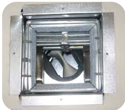
1212 MLK Apartments also incorporates Aldes Constant Air Regulator (CAR) dampers at each bathroom exhaust point. In order to regulate air flow, CAR dampers incorporate a silicone bulb that expands when the pressure drop across the damper exceeds 50 Pa.

ing. These results indicate that in a six-story multifamily building, state-of-the-art elevator technology is not justified based on energy savings alone (there are, of course, maintenance and reliability benefits associated with new elevator technology).