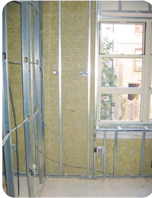
The building walls are insulated with R-4.3 Roxul 1-inch rigid (mineral wool) insulation and R-13 fiberglass batts within 3 1/2-inch interior steel framing. The rigid insulation, placed between the steel studs and the CMU block wall, minimizes thermal bridging through the steel.

More than any other factor, mechanical ventilation drives the heating load in new multifamily buildings in New York City. Small apartments combined with strict exhaust CFM requirements in the city's building code result in relatively high mechanical air change rates. At 1212 MLK Apartments, the ventilation system was designed to minimize overall apartment air change rate while still meeting code. The design exhaust ventilation rate for all bathrooms is 50 CFM. Most kitchens qualified as "super kitchens," which are greater than 59 ft 2 floor area with a pass-through to an adjacent room with operable windows, and did not require mechanical ventilation. The studio kitchens are smaller than 59 ft 2 and can't use the living area as a pass-through to get to an operable window. Indeed, the living area is also a sleeping area in a studio apartment. The small kitchens therefore required a provision for 120 CFM of mechanical ventilation (not necessarily continuous). Ironically, the smallest apartment requires the most ventilation by code.