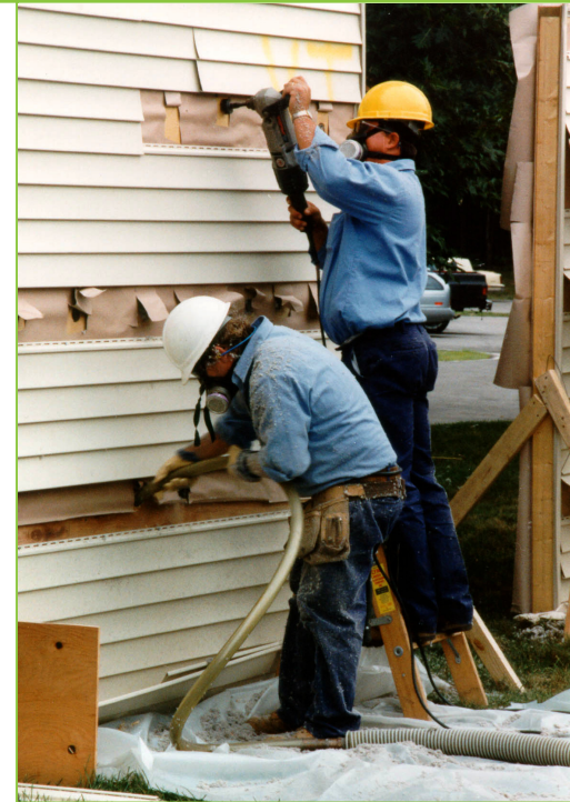
Weatherization staff install sidewall insulation to increase the energy efficiency of a home.