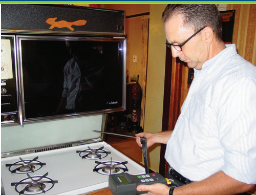
Weatherization technician tests gas range for carbon monoxide.